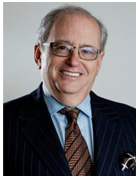
Dr. Norm Ornstein

be on Friday afternoon at 3:15 p.m. in the Crystal Ballroom at which time the MASA legislative platform will be discussed. We will also provide an update on assessment and accreditation. The final general session and brunch will feature a discussion related to the election year in Missouri.